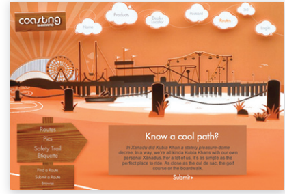
A SKETCH (left, seat plus helmet storage) and a PROTOTYPE (middle) show elements of Coasting bicycles. Shimano's Coasting WEBSITE (right) points users to safe bike paths.

an activity that was simple, straightforward, and fun. Coasting bikes, built more for pleasure than for sport, would have no controls on the handlebars, no cables snaking along the frame. As on the earliest bikes many of us rode, the brakes would be applied by backpedaling. With the help of an onboard computer, a minimalist three gears would shift automatically as the bicycle gained speed or slowed. The bikes would feature comfortably padded seats, be easy to operate, and require relatively little maintenance.