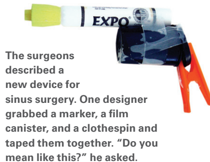
The surgeons described a new device for sinus surgery. One designer grabbed a marker, a film canister, and a clothespin and taped them together. "Do you mean like this?" he asked.

During the earliest phase of the project, the core team collaborated with nurses to identify a number of problems in the way shift changes occurred. Chief among these was the fact that nurses routinely spent the first 45 minutes of each shift at the nurses' station debriefing the departing shift about the status of patients. Their methods of information exchange were